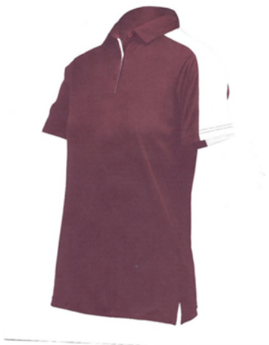
Male Shirt for 2022-2023